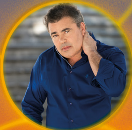
2 August Toy