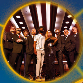
31 July Cais Sodré Funk Connection