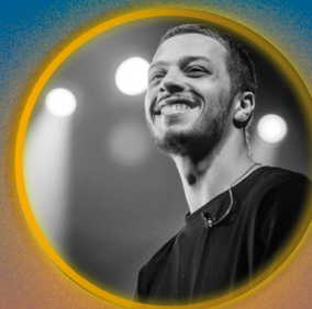
5 August Slow J